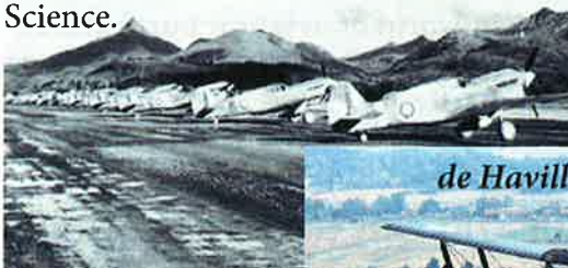
de Havilland Tiger Moth